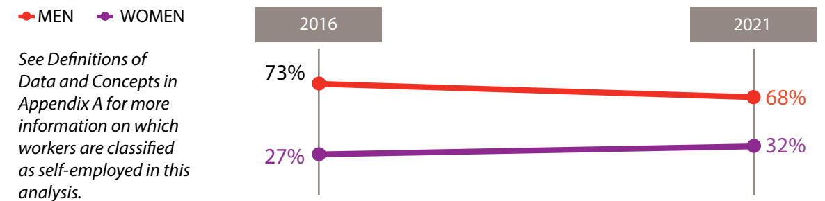
Data Source: American Community Survey (ACS) 5-year estimates (2021), analyzed by UNO CPAR.

“Yes, so I take on a lot of [extra] work at [my organization] that is compensated. So, I do extra research in the summer. I might teach an extra class . . . So I’ve been very fortunate that I probably make 1.5 times what I would be making because I have access to supplemental income. We would be in a much more financially insecure position if I was not able to do that.”